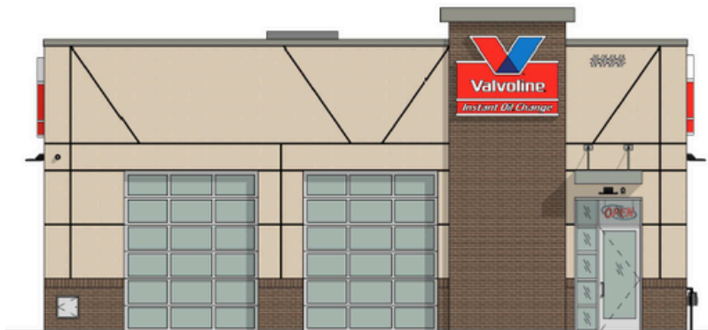
Proposed plans, provided by applicant.