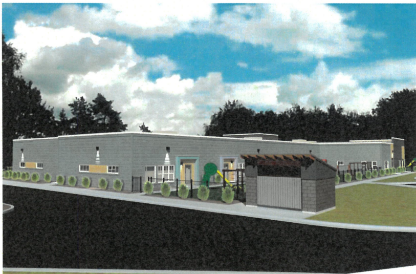
4 24005 Kids Haven Monticello 02-02-26 SW View