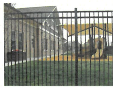
EXAMPLE METAL FENCE