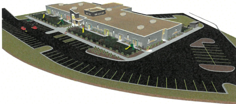
2 24005 Kids Haven Monticello 02-02-26 NW Aerial View