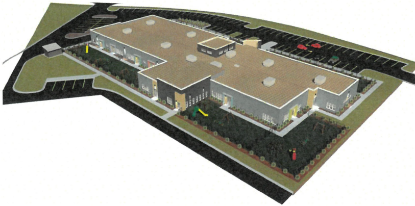
3 24005 Kids Haven Monticello 02-02-26 SE Aerial View

SCALE INDICATED BASED UPON PRINTED 24" X 36" (ARCHITECTURAL D) SHEET