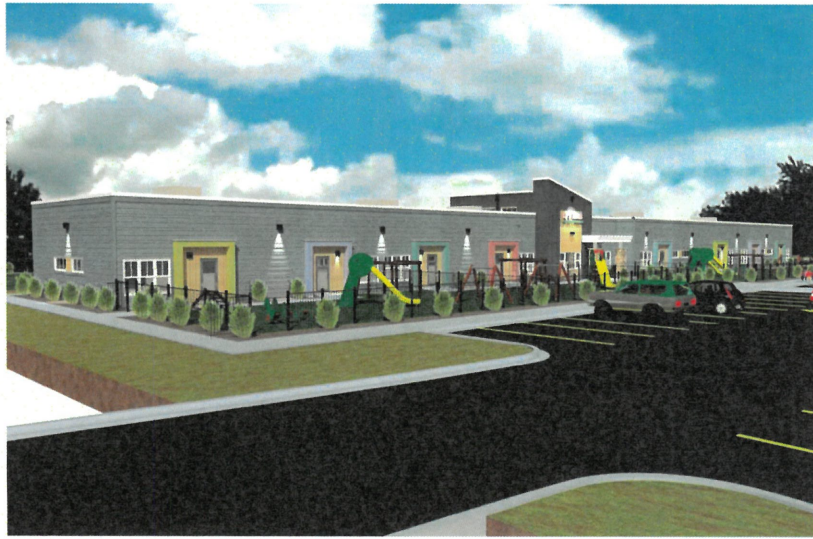
1 24005 Kids Haven Monticello 02-02-26 NE View